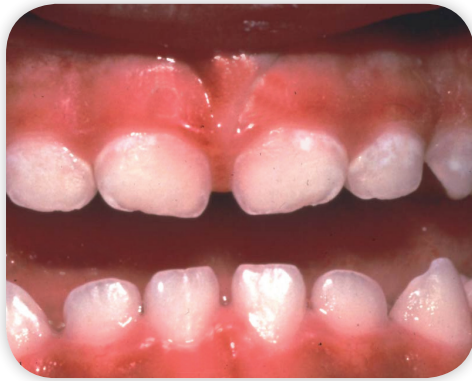
White spots (the start of cavities)